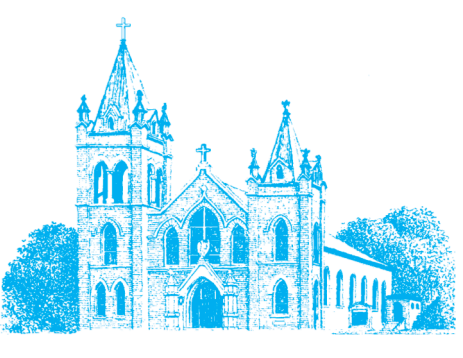
St. Gabriel Archangel