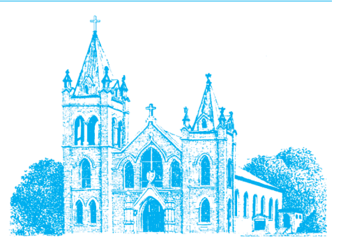
St. Gabriel Archangel