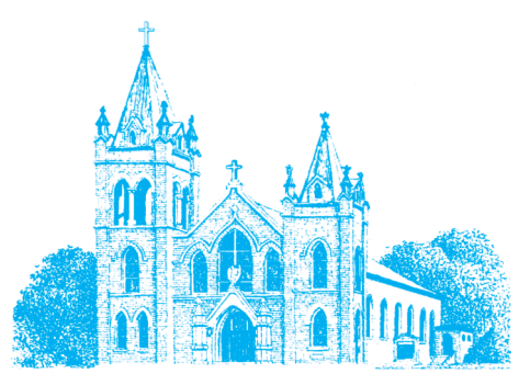
St. Gabriel Archangel