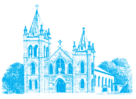
St. Gabriel Archangel

Welcome Breakfast St. Gabriel's Hall Sunday, April 14th 7:00 to 10:00 am All are invited to meet our new parishioners