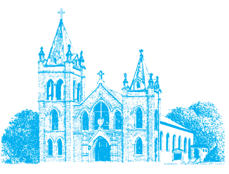
St. Gabriel Archangel