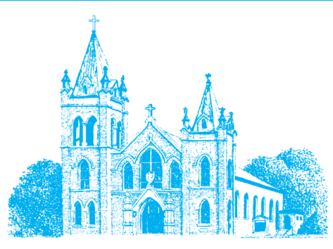
St. Gabriel Archangel

Welcome Breakfast St. Gabriel's Hall Sunday, April 14th 7:00 to 10:00 am All are invited for breakfast and to meet our new parishioners