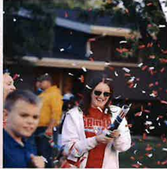
Homecoming Parade 2024!!