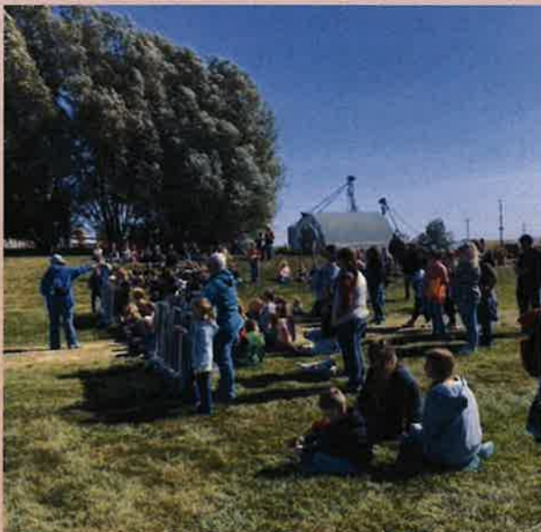
Vesperman Farms 2024!